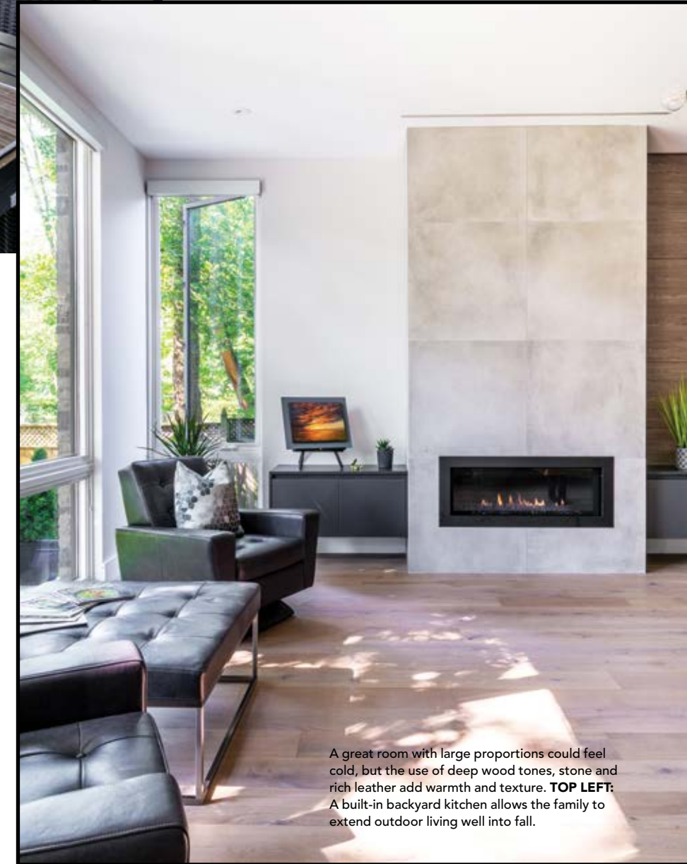
A great room with large proportions could feel cold, but the use of deep wood tones, stone and rich leather add warmth and texture. TOP LEFT: A built-in backyard kitchen allows the family to extend outdoor living well into fall.