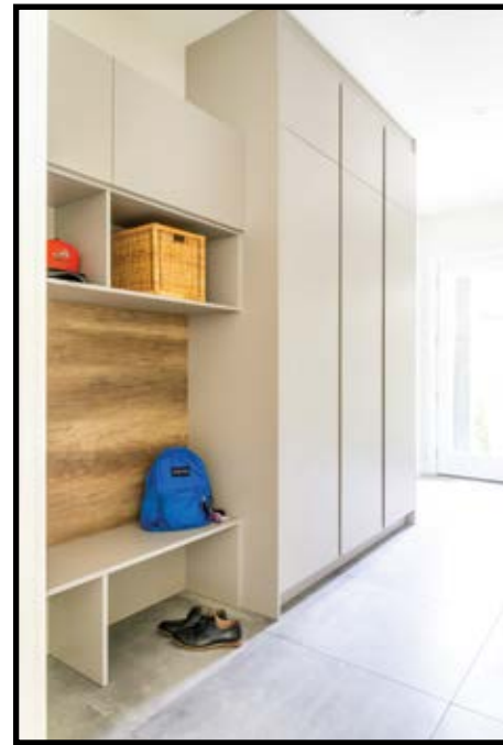
LEFT: A glass-enclosed bridge overlooking the modern kitchen connects the two wings on the upper level. ABOVE: A mudroom with integrated storage brings practicality to the main floor. BELOW: The use of windows instead of a traditional backsplash is an unexpected and dynamic addition. All outlets are integrated into the solid surface counter.