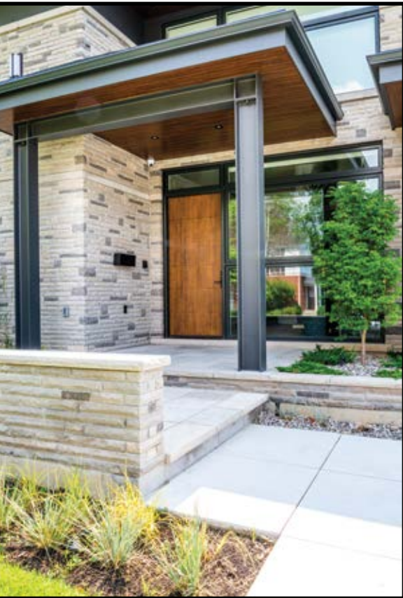
ABOVE: Modern lines are softened with warm wood, Owen Sound ledge rock and touches of greenery. RIGHT: A two-storey entrance and cantilevered staircase create a dramatic welcome. OPPOSITE: The home was carefully constructed to allow for maximum natural light.