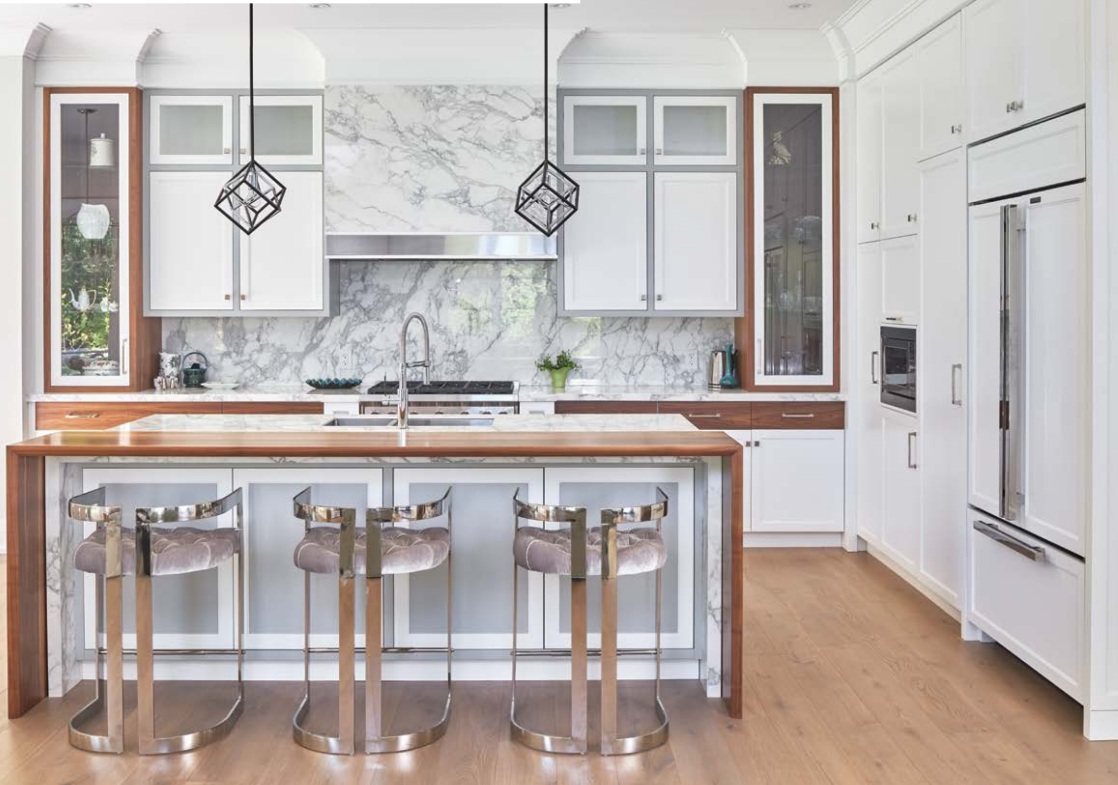
LEFT: The kitchen was designed to be the nucleus of the home. Luxe finishes like marble and walnut add depth and warmth. BELOW: The dinette area takes advantage of sunlight and is framed by panoramic views to the outdoors.

“WE ALL WANTED A LARGE KITCHEN ISLAND AND OPEN DINING AREA WHERE FAMILY AND FRIENDS COULD GATHER FOR GOOD CONVERSATION AND FOOD.” –Ash Mahboubi