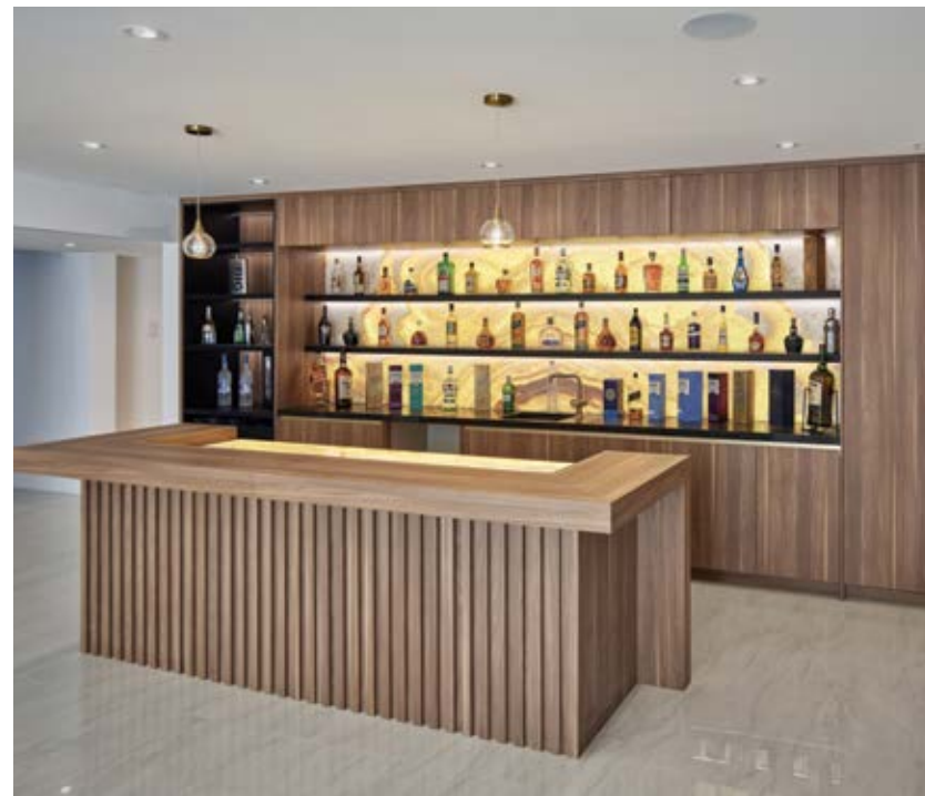
TOP LEFT & RIGHT: No detail was overlooked. Picture-frame mouldings, custom built-ins and gas fireplaces add personality and warmth to the rooms. ABOVE: Each bathroom was given contemporary and practical finishes. RIGHT: The custom backlit onyx crystal stone bar is the centrepiece of the lower level's entertaining space and a family favourite.