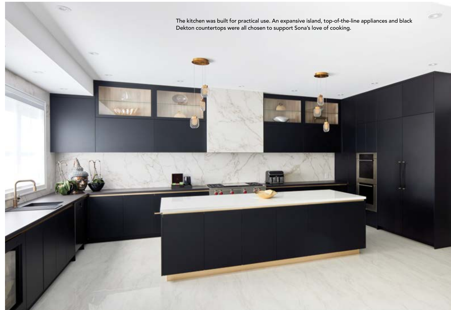
The kitchen was built for practical use. An expansive island, top-of-the-line appliances and black Dekton countertops were all chosen to support Sona's love of cooking.

Inside, rooms branch off from the foyer with an office to the left, showcasing treasures in built-ins by Magnum Millwork Inc. , and a formal living room to the right. It opens into the heart of the home, an opulent open-concept living room, kitchen and dining area shining in a palette of white, black and gold. The space is flooded with natural light that bounces off the bright tiled floor from Ciot . Continued on page 50